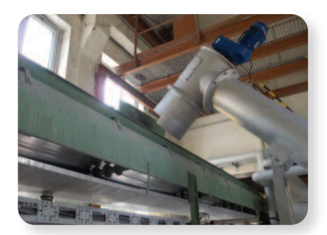
Optional Screenings Cutter