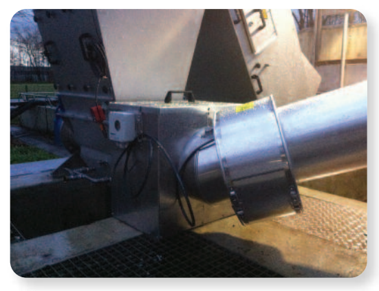
Optional freeze protection available

Automatic – Back pressure is automatically generated by a hydraulic cylinder controlled in the main control panel. The pressure device is housed in a hatched access box which is integral to the discharge pipe.