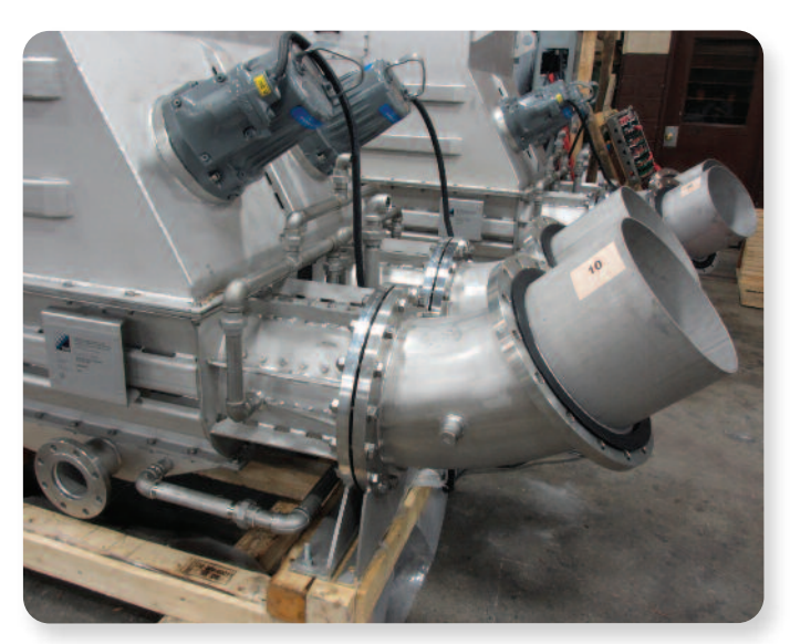
SPW 350-DM with optional impellers to increase washing function.