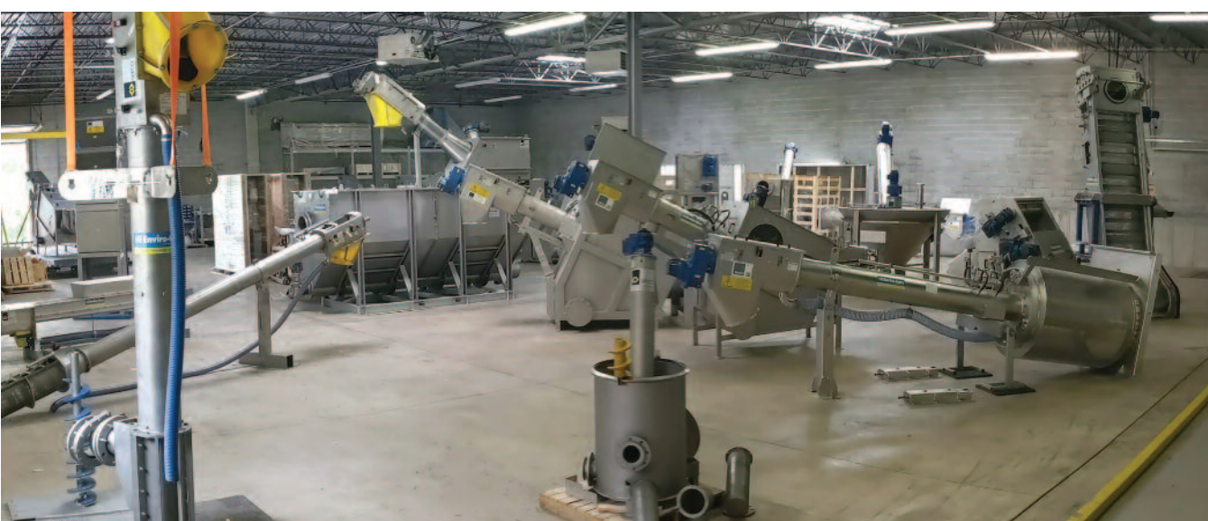
Plenty of room to view the equipment.