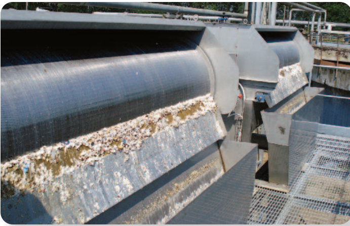
Flo-DrumSieve externally-fed drum screen

The Flo-DrumSieve externally-fed screen with stainless steel wedgewire media has a unique advantage - a very small footprint relative to the high flow rate and solids loading it can handle. Thus, industrial and municipal customers have found it to be one of the most flexible screens to install.