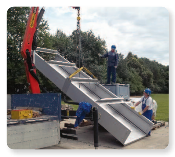
Field assembly of long MultiRake Screen.