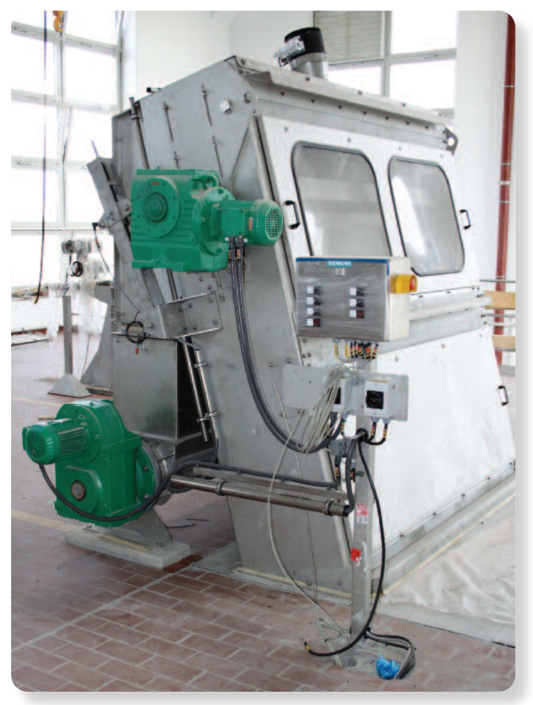
Over 150 FSM MultiRakes installed worldwide.

The rake teeth penetrate the bar openings removing the collected solids as they move up the bar rack. As the rake reaches the discharge point, an automatic cleaning device removes the solids. The return path of the rakes is on the upstream or dirty side of the bar field. This prevents any carry-over of screenings to the clean side of the channel.