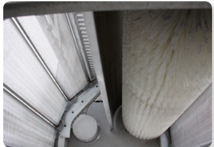
No carry over of screenings to downstream process.