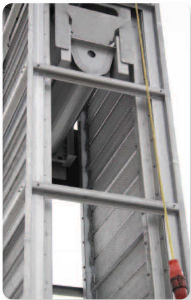
Solids are collected just below the discharge point at the apex of the filter belt.