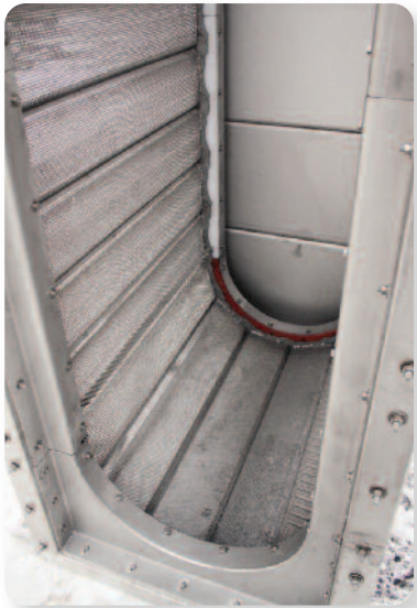
Special side seals on the frame prevent by pass.