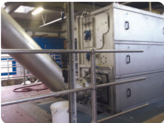
Completely Enclosed for Odor Control.